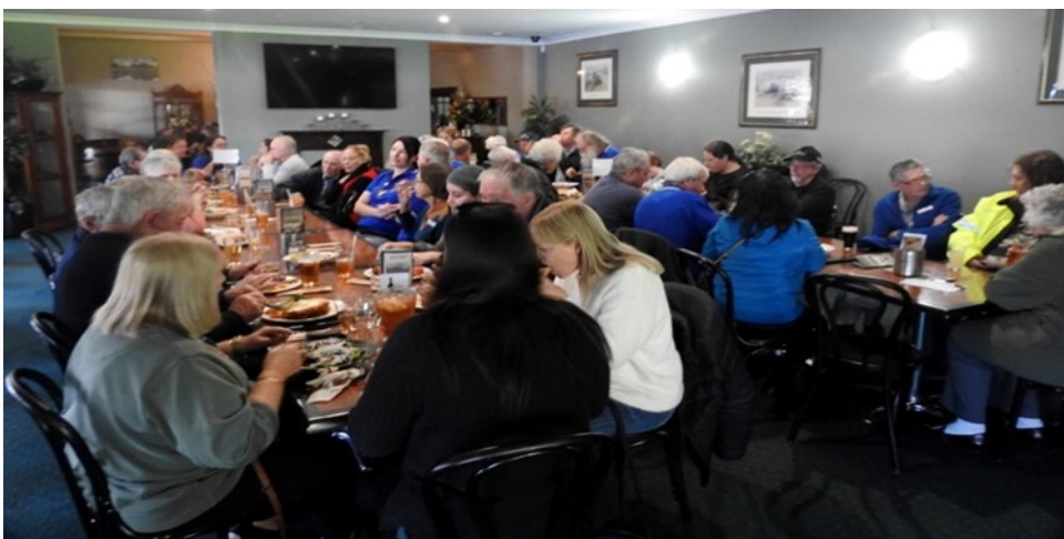
Members enjoying their lunch

The venue was very busy, but the food came out very quickly, all things considered, I think most members and guests enjoyed their food, I know I did.