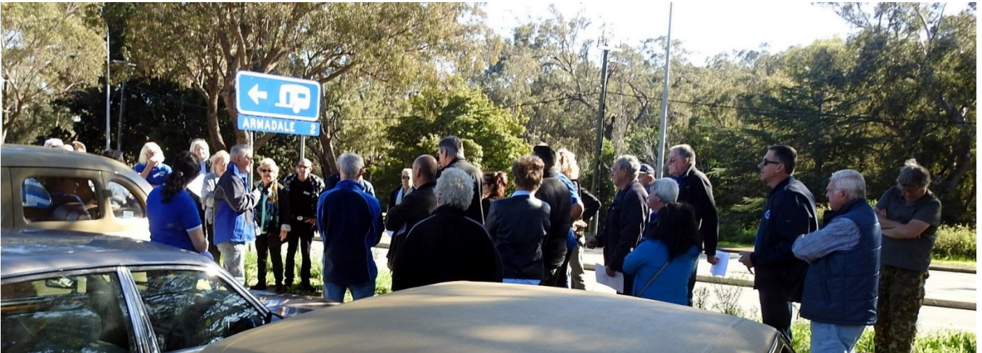
Everyone met at the Old Narrogin Inn in Armadale

Some of us started the journey from the clubrooms and headed down to the Narrogin Inn car park where we picked up more members, some joined us at the venue as they were local.