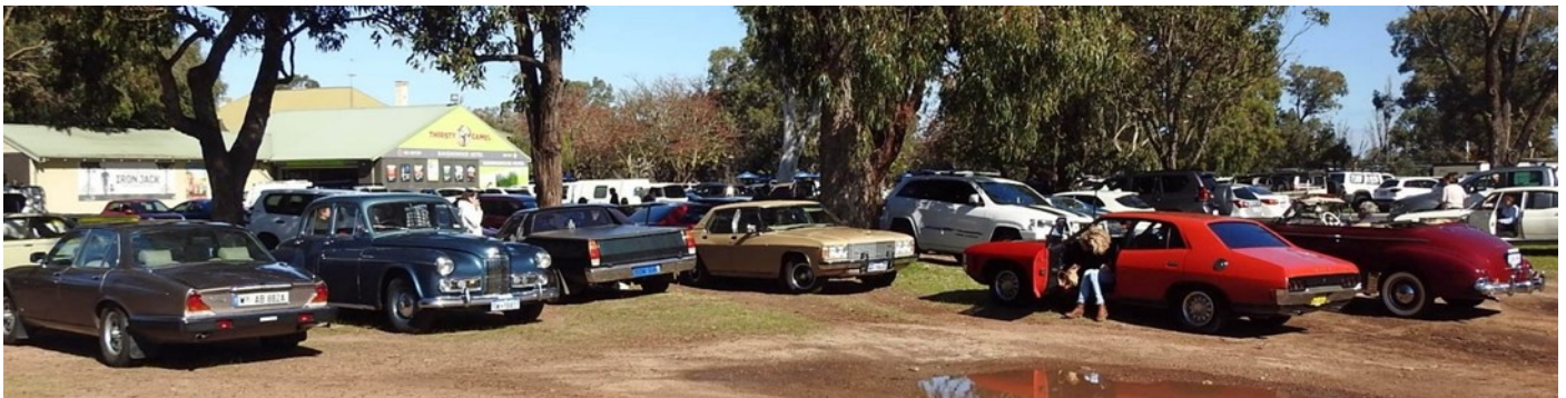
Cars on arrival at the Ravenswood Hotel