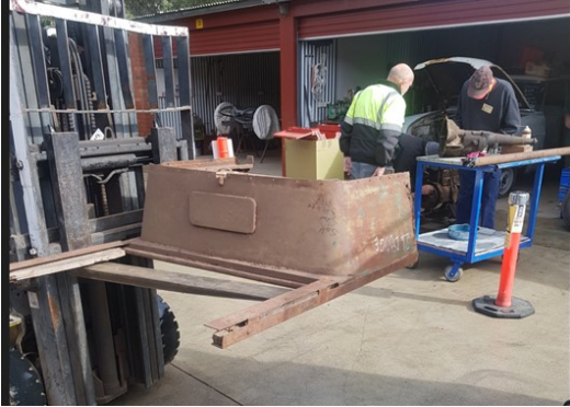
Collecting the 1924 firewall