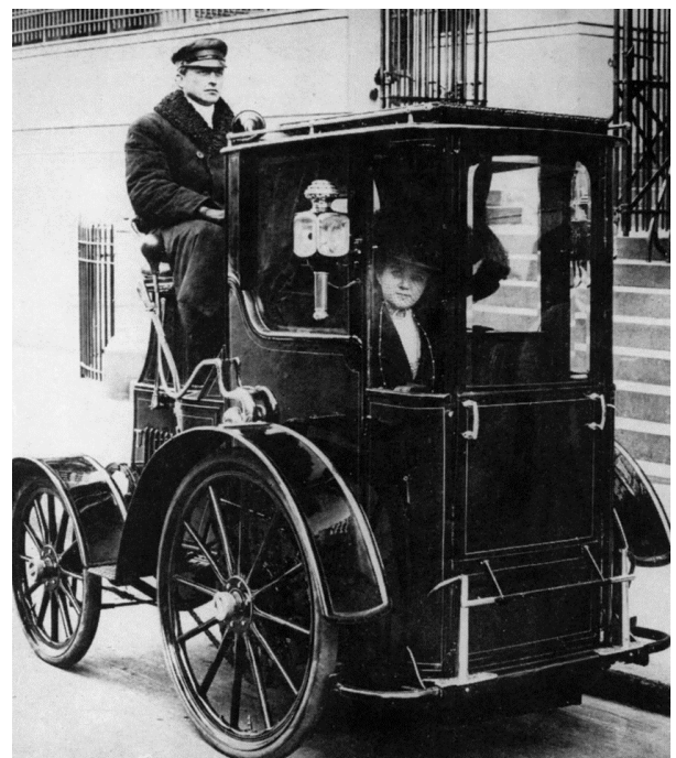
In July 1897 The Samuel's Electric Carriage & Wagon Company put the first motorised taxi on the streets of New York. They had 62 cabs in use within a year.